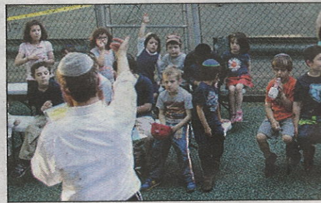
LAG BA'OMER BBQ – More than 200 people attended the joint annual family barbecue and bonfire arranged by Temple Beth Shalom and Congregation Adath Israel, to celebrate Lag Ba'Omer in honor of Rabbi Bar Yochai. The festivities concluded with the recitation of 12 Torah passages along with singing around the bonfire.