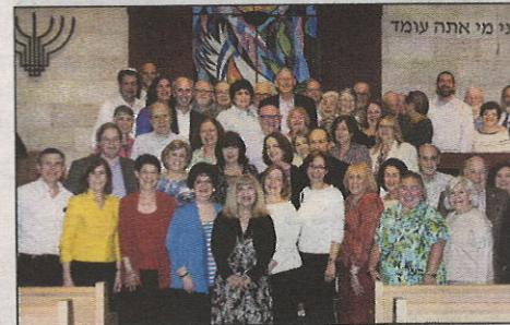
SILVER ANNIVERSARY – Congregation Beth Israel of Plains, held a Silver Anniversary Shabbat and reception on May 8 in honor of members who have belonged to the synagogue for 25 years or more. About 150 congregants reached this milestone.