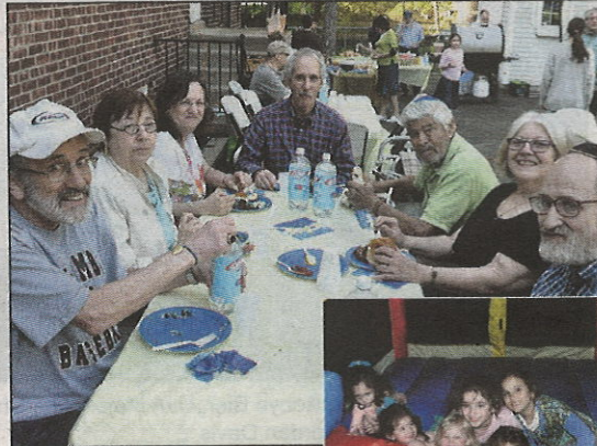
LAG BA'OMER FUN – Members of Maplewood Jewish Center enjoyed a Lag Ba'Omer barbecue and family afternoon on May 7. In addition to a bonfire, barbecue, and live music, children played in a bounce house, inset.